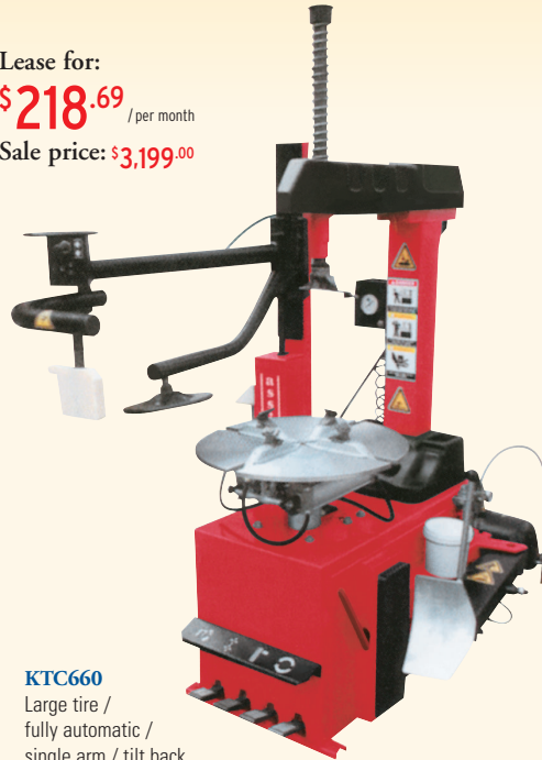
KTC660 Large tire / fully automatic / single arm / tilt back

Lease for: $218.69 /per month Sale price: $3,199.00