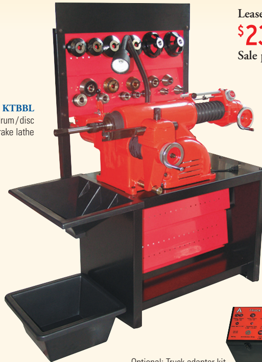
KTBBL Combination drum/disc Brake lathe

Lease for: $239.20 /per month Sale price: $3,499.00