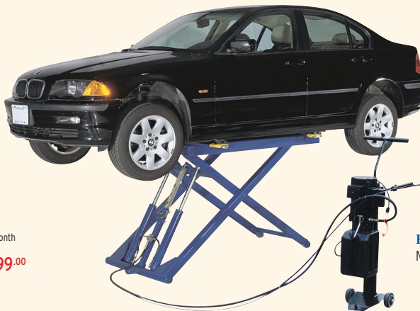
KSL6M Mid-rise lift

Lease for: $95.64 /per month Sale price: $1,399.00