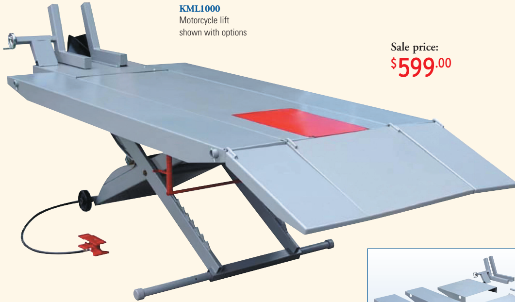
KML1000 Motorcycle lift shown with options

This air powered lift table is ideal for making repairs to motorcycles, snowmobiles, ATVs, jet skis, etc. The 1,000 lb. capacity, extra large platform brings all your jobs to a comfortable 30" working height. Choose from a range of accessories to customize this table for your shop.